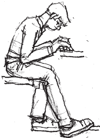
The wrong way to sit